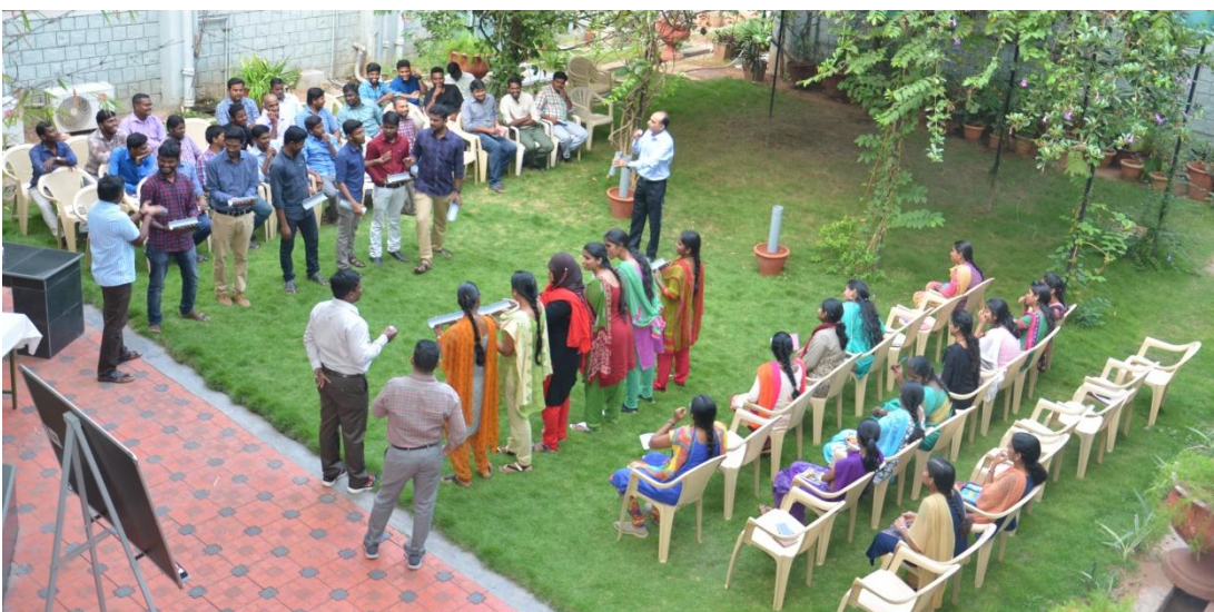
Following the event, the Director invited the research scholars to make their presentations.